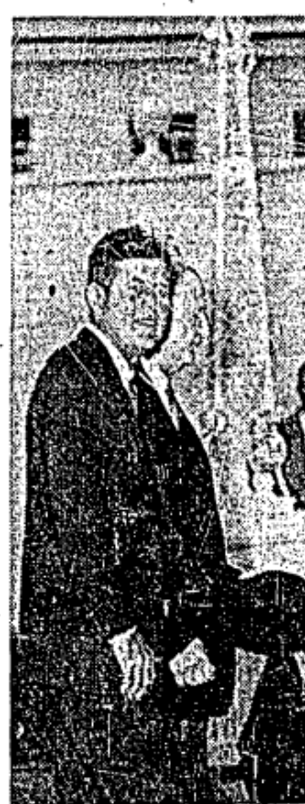
President Kennedy pictured with President de Valera before entering Aras an Uachtaráin last night.

The U.S. President said that President de Valera was a valued friend of his father for many years, and he had spoken highly of him.