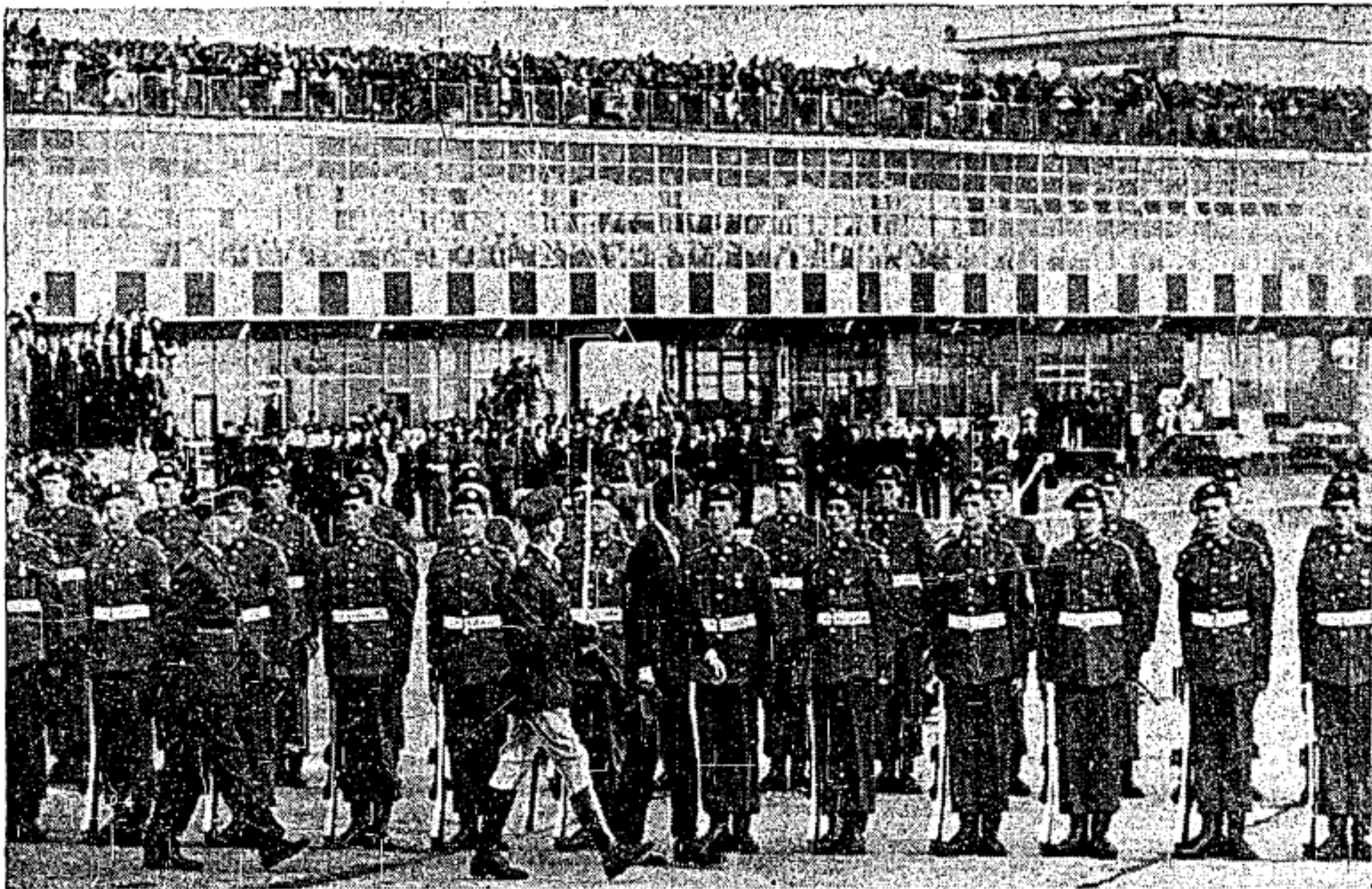
President Kennedy inspects the Guard of Honour on arriving at Dublin Airport.