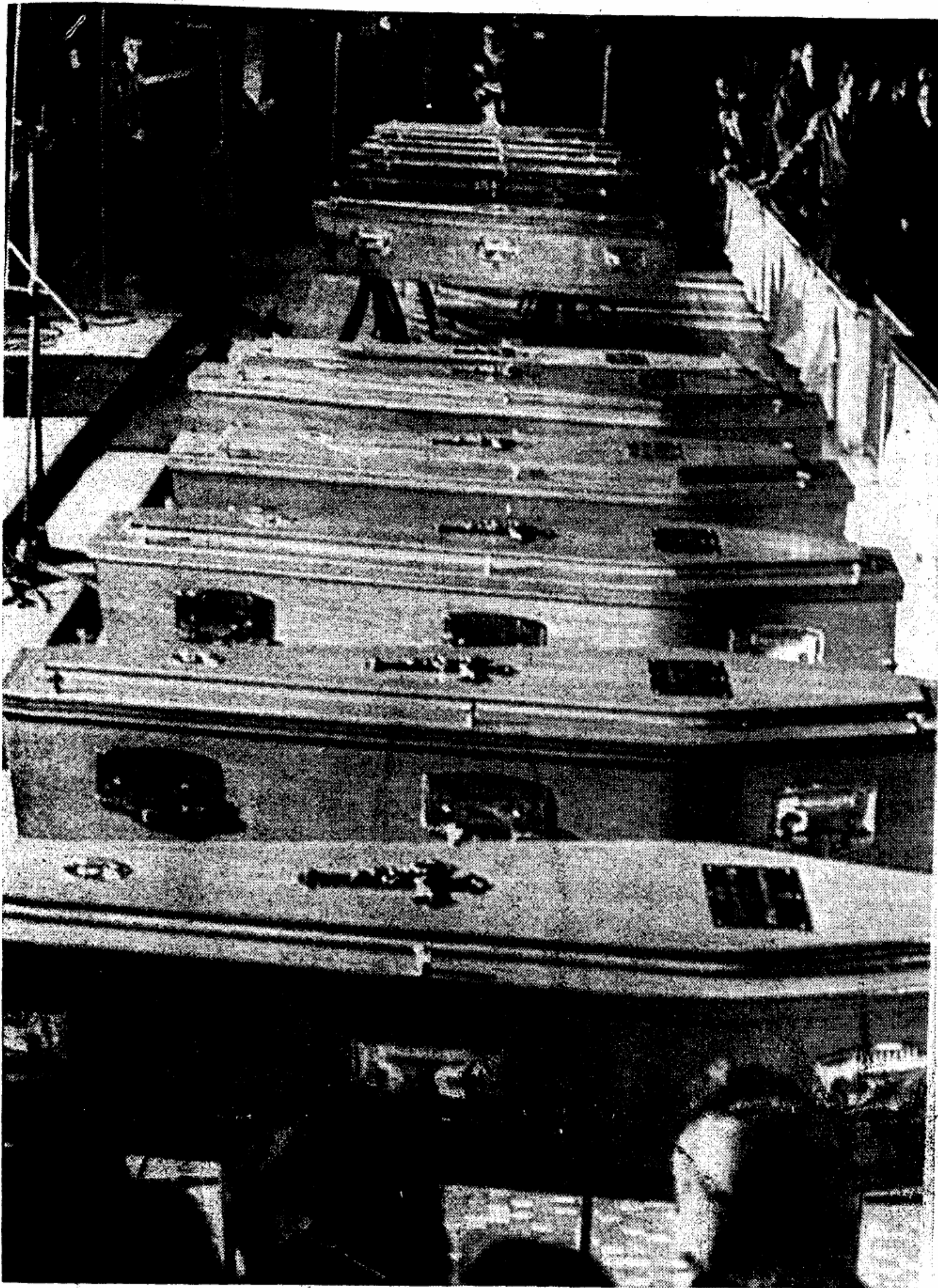
Focal point of Ireland's day of mourning—the coffined remains of the 13 victims of the Derry shooting lying in St. Mary's Church in Derry's Creggan area last night. (Other North reports: pages 3, 5 and 8. Pictures: page 13).