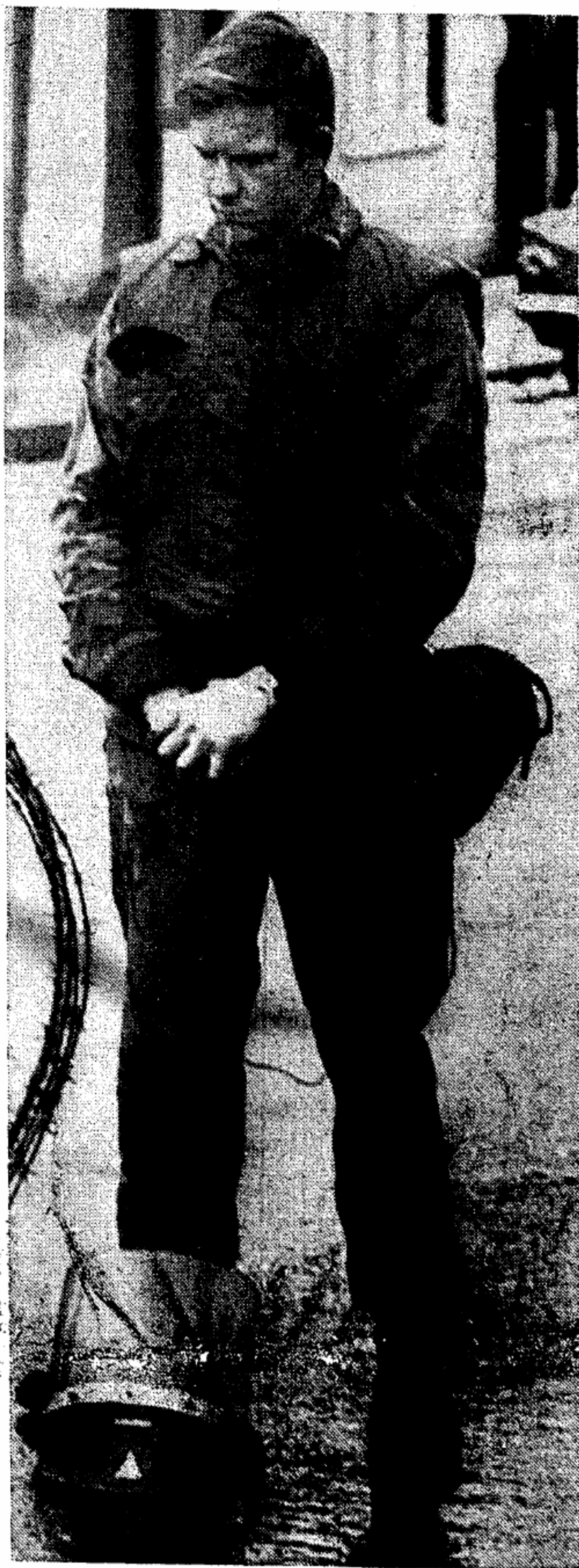
A British soldier on duty in Dungiven, riot helmet doffed, bows his head in prayer during the minute's silence in the town for the victims of the Derry massacre.

The Burgh Quay and O'Connell Street offices of THE IRISH PRESS will not open until 10 a.m. today as a mark of respect for the victims of the Derry shooting and to enable staffs to attend a special Mass arranged by newspaper workers at nine a.m. in St. Saviour's Church, Dominick St.