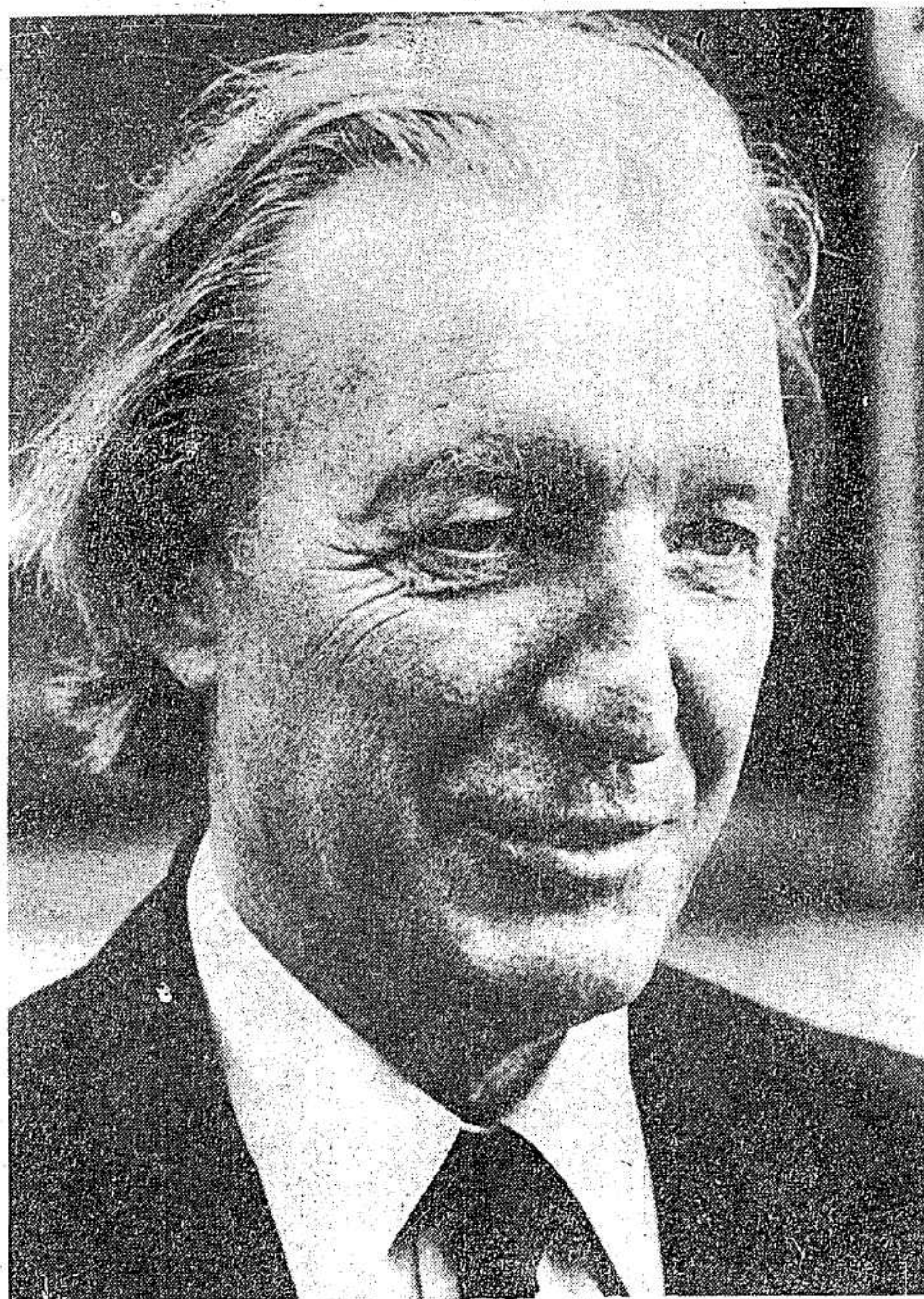
Mr. Haughey . . . the new Taoiseach.

After the brief meeting, Mr. Haughey hustled through