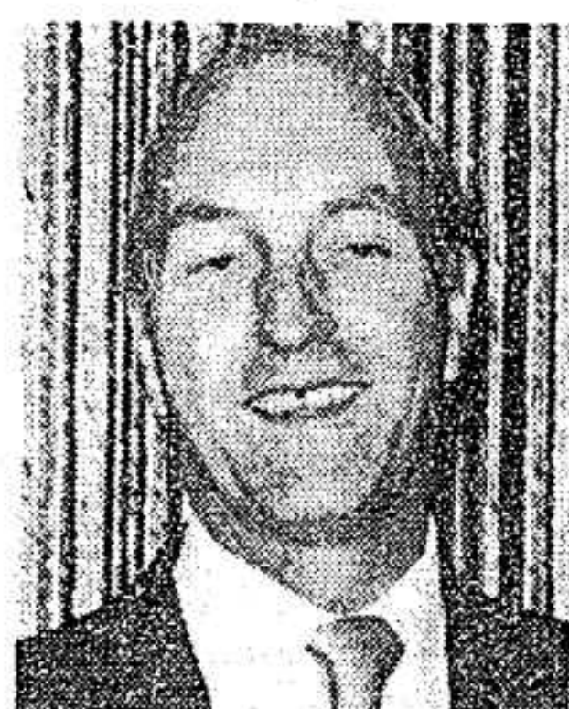
Mr. George Colley