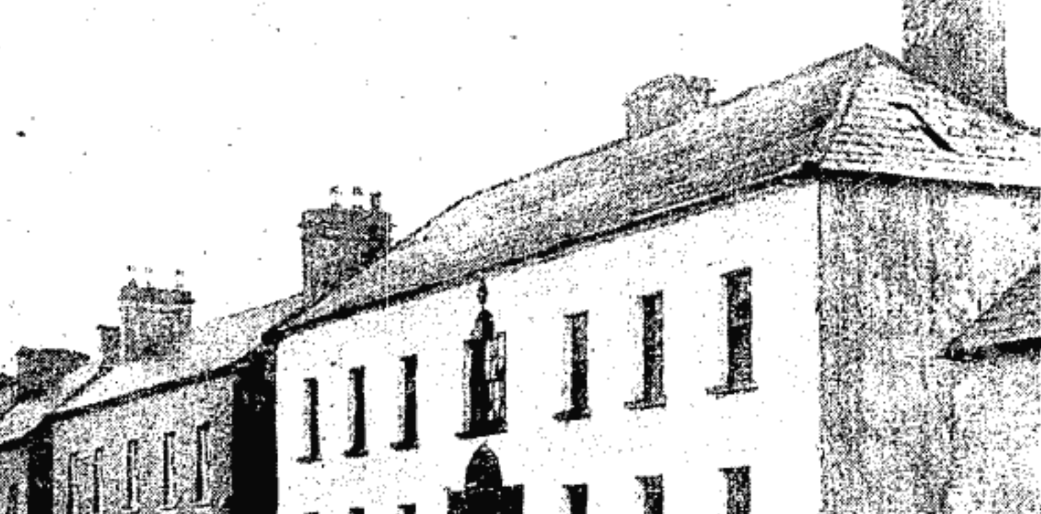
The fine building on the right is the R.I.C. Barrack. So complete were the arrangements of the raiders that the surprise attack enabled the capture to be made without the breaking of a pane of glass.